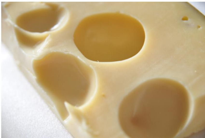
The current regulatory framework for chemicals in consumer articles

The need to set (additional) chemical requirements for other product groups - such as medical devices, electrical and electronic products, personal protective equipment, furniture, sports/playground surfaces and equipment or products made from leather or paper - needs to be investigated.